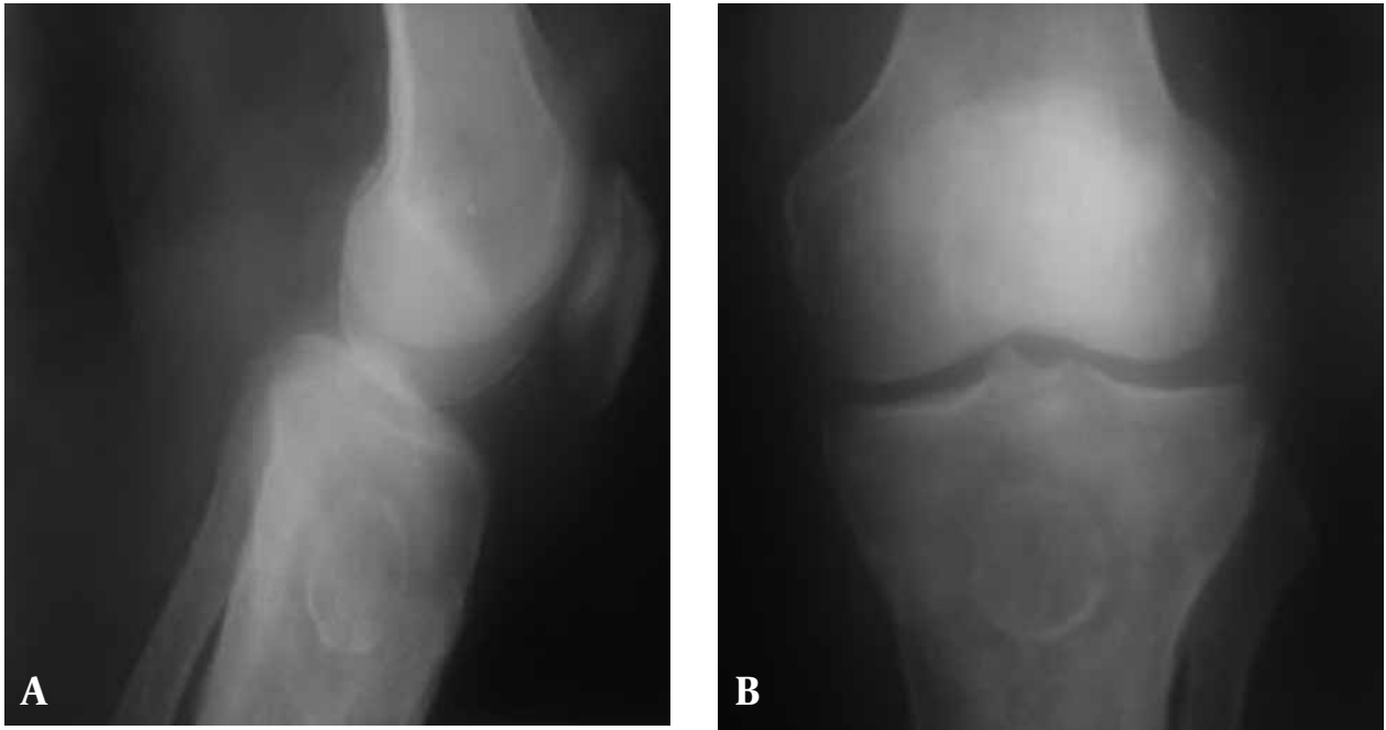
Figure 1. A-69-year-old male with left knee pain and a well corticated ossified intramedullary lesion in the proximal tibial metaphysis; A, Lateral view; B, Antero-posterior view