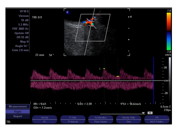
Figure 1 Color Doppler ultrasonogram showing central retinal artery spectral Doppler waveform in a cataract patient. The resistive index was 0.61.

Our study included 112 patients with 224 eyes (53 female, 59 male) and 38 controls with 76 eyes (17 female, 21 male).