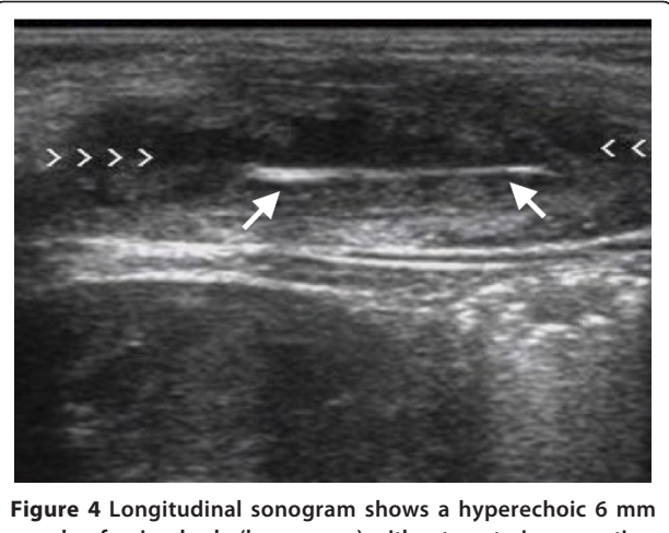
Figure 4 Longitudinal sonogram shows a hyperechoic 6 mm wooden foreign body (long arrow) without posterior acoustic but with surrounding halo sign (arrowhead) due to soft tissue abscess in the forearm.

absorption it could be seen hypo-intense on T1 and hyper-intense on T2 images [5].