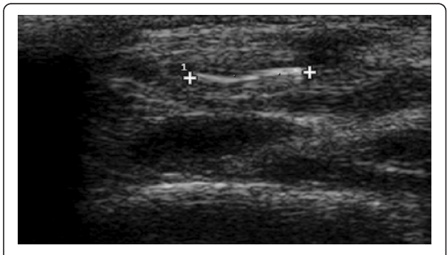
Figure 1 Longitudinal sonogram shows a hyperechoic 4 mm long broken glass (long arrow) without posterior acoustic shadowing in the forearm of a 24 years old man.

The type of foreign body, its mean \pm SD measure, and the body locations are expressed in table 1.