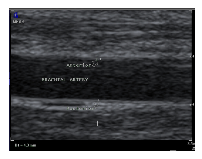
Figure I Longitudinal ultrasonogram of the brachial artery diameter from anterior to posterior wall.

Data were calculated as the absolute diameter of the brachial artery (in mm) and the percent increase from baseline after cuff release and in response to ischemia.