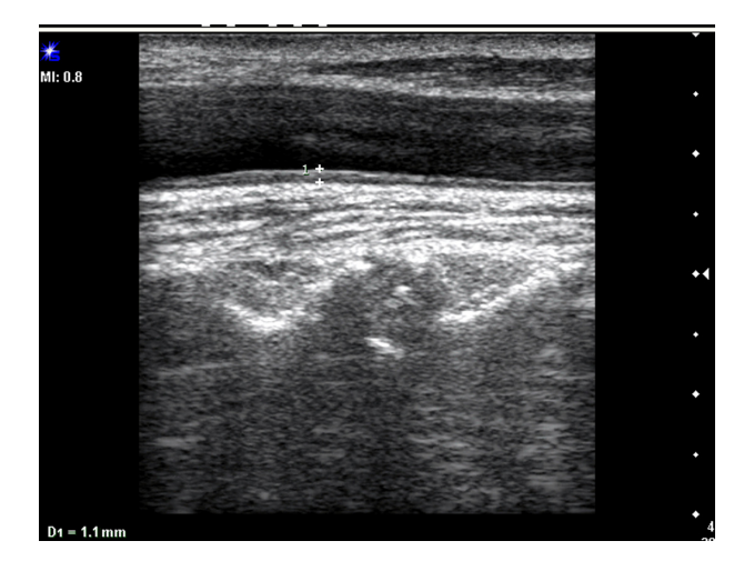
Figure 2 Longitudinal ultrasonogram of common carotid artery shows the carotid intima-media thickness in the posterior wall.