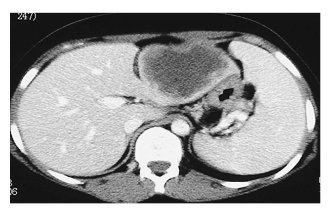
Figure 1. Axial computed tomography showed a well-defined hypodense mass in the left lobe of the liver.

lobectomy. Macroscopic appearance of the lesion was an ill-defined creamy fleshy nodule, 7 cm in diameter, with central necrosis. Microscopic evaluation showed diffuse proliferation of large lymphoid cells with prominent eosinophilic nucleoli, occasional polylobated nuclei, and moderate mitosis (Figure 2). Immunohistochemistry showed strong positivity for CD20, 70% nuclear staining for Ki-67, and negativity for CD30 (Figure 3). The Ki-67 is a marker for proliferative activity, which was high in this case and CD30 negativity ruled out Reed-Steinberg-like polylobated nuclei.