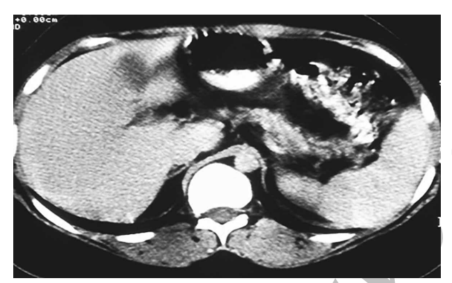
Figure 4. Axial computed tomography 1 year after the end of chemotherapy (control).

cyclophosphamide, 1000 mg, hydroxy adriamycin, 80 mg, and oncovin, 2 mg, plus prednisolone, 100 mg/d, for 5 days (R-CHOP protocol). During and after chemotherapy, there were not any rises in serum creatinine level. Immunosuppressive therapy with sirolimus, 2 mg/d, and mycophenolate mofetil, 1.5 g/d, was started 2 months after all courses of chemotherapy were completed. Sixteen months after the last course of chemotherapy, she was in a good condition without any recurrences of lymphoma in the liver or any other organs (Figure 4), and her serum creatinine was 1.2 mg/dL.