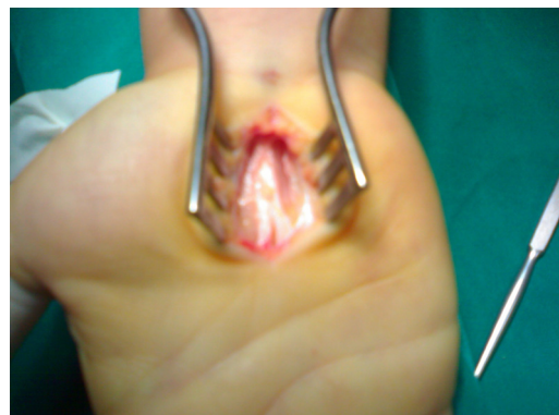
Figure 1. Palmaris profundus tendon within the carpal tunnel, lying over the investing tissue of the right median nerve.

electrophysiologic examination. Under local anesthesia, carpal tunnel release was performed through the classic interthenar incision. After dividing the transverse carpal ligament, an aberrant tendon was discovered on the anterior surface of the median nerve within its investing tissue (Figure 1). The tendon was inserted deeply into the palmar aponeurosis (Figure 2). There was no median artery. The median nerve was congested but otherwise normal. The palmaris longus tendon was palpable above the wrist crease. I believe there was a palmaris profundus tendon. Traction applied to the abnormal tendon caused excursion of the median nerve but no movement of the palmaris longus. The tendon detached distally and a 3-cm segment of the aberrant tendon excised. Further