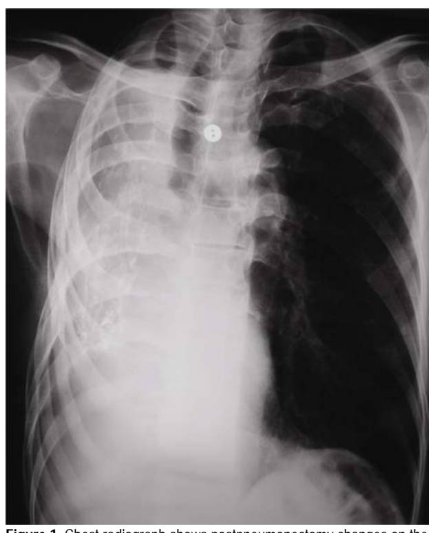
Figure 1. Chest radiograph shows postpneumonectomy changes on the right side with calcification and rightward deviation of the trachea.