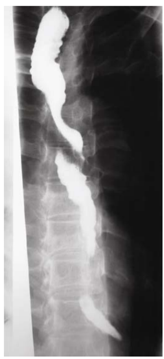
Figure 2A . Barium esophagography showing the trachea and esophagus on the right side then the esophagus crossed to the left, where barium is cut due to compression of esophagus between left main bronchus and spine.