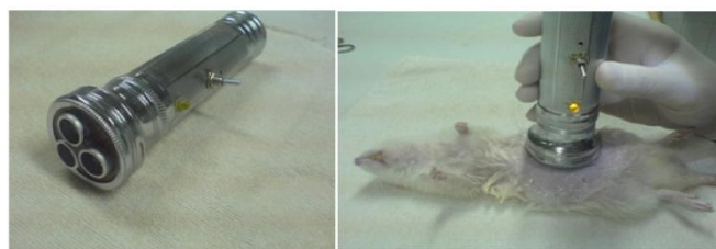
Fig. 1: An array of air ultrasonic ceramic transducer (Left), a rat placed in a dorsal decubitus position with the transducer array attached (Right).

In the previous study, we developed equipment for transdermal insulin delivery, so that the geometrical and physical characteristics of this equipment were briefly described in the literature (Jabbari et al. , 2015). Ultrasound was produced by an air ultrasonic ceramic transducer (SQ-40-T-10B) composed of a piezo ceramic disc which converts electric energy into mechanical energy. The diameter of each ultrasonic sensor was 9.8 mm and the resonant frequency of them was 40 \pm 1.0 kHz. Figure 2 shows an array air ultrasonic ceramic transducer used in this study. The array includes three ultrasonic probes connected in parallel.