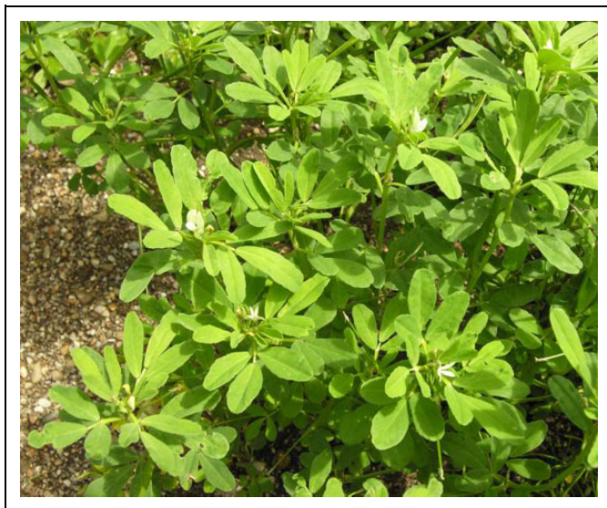
Figure 1. Trigonelline leaves.