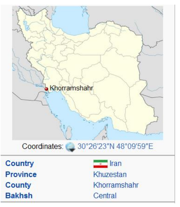
Fig.1: Location of Khorramshahr city, Iran

Given the importance of what has been mentioned so far about calcium intake among adolescent girls and since no comprehensive study was conducted in Khorramshahr city ( Figure.1 ), the aim of the present study was to investigate the nutritional behavior of female high school students of Khorramshahr regarding the consumption of calcium-rich foods.