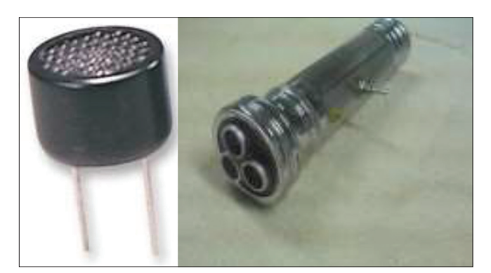
Figure 1: Shape of SQ-40T transducer (left) and an array of air ultrasonic ceramic transducer (right)

All the animal procedures were performed in accordance with the protocols approved by Ethical Committee of Urmia University of Medical Sciences in the use of lab