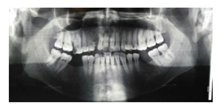
Figure 3: The patient followed up, no symptoms of recurrence was observed

patient was followed up for 9 months and no symptoms of recurrence was observed (figure 3).