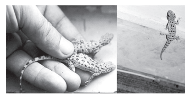
Fig. 3. Adults of spotted leopard Gecko in living room in Kashan (prepared by R. Dehghani)