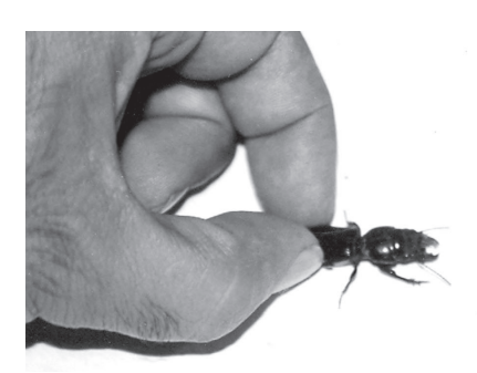
Fig. 4. The picture of Scarites subterraneus beetle (prepared by R. Dehghani)

Laboratory observations proved that this insect easily attack scorpions that weigh 2 or 3 times more than its own weight and feeds on them. Odontobuthus doriae scorpions with approximately 7 to 8 cm length and Mesobuthus eupeus scorpions with 5 cm length are hunted and fed by this beetle (Fig. 7).