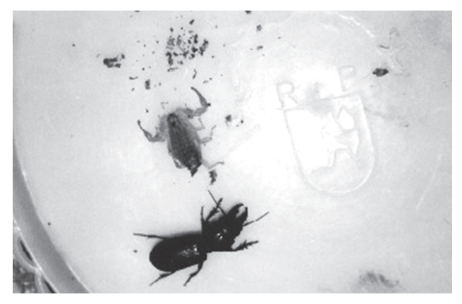
Fig. 7. Predator beetle, Scarites subterraneus after feeding of M.eupeus scorpion (prepared by R. Dehghani)

The use of these insects can be effective to control Scorpions. It would be more efficient to support and identify natural enemies rather than using toxins in terms of both economy and environment pollution. Public education about useful and harmful animals can bring about changes in the attitude of the people and results in worthwhile impact on the culture of rural and urban community particularly in the areas in which there are plenty of scorpions.