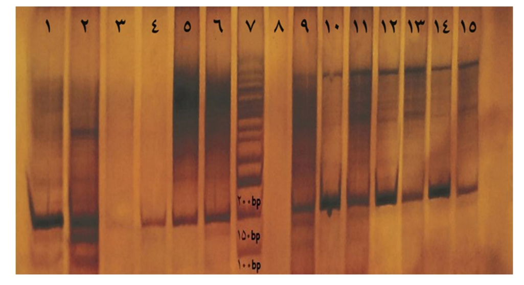
Fig 2. Acrylamide gel Represents ARMS-PCR products Position of rs57095329. Wells 1 and 2: AA, Wells 3 and 4: GG, Wells 5 and 6: AG, Wells 7: Size marker 50 bp, Wells 8 and 9: GG, Wells 10 and 11, Wells 12 and 13, Wells 14 and 15: AG

It should be noted that the allelic and genotypic frequencies in this group also followed the Hardy-Weinberg equilibrium.