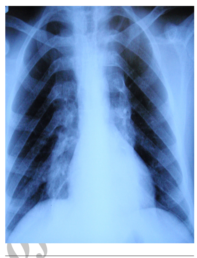
Figure 2. Chest X-Ray of a 28-Year Old Man With Thalassemia Intermedia Who Was Receiving Hydroxyurea, Paraspinal Masses are Evident.