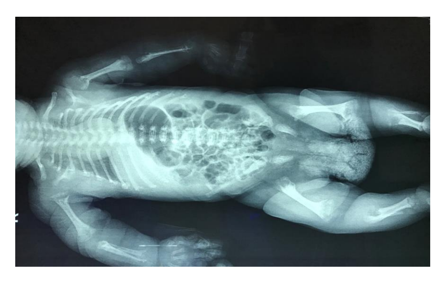
Fig.2: Baby gram, showing epiphyseal dysgenesis and shortness of limbs.