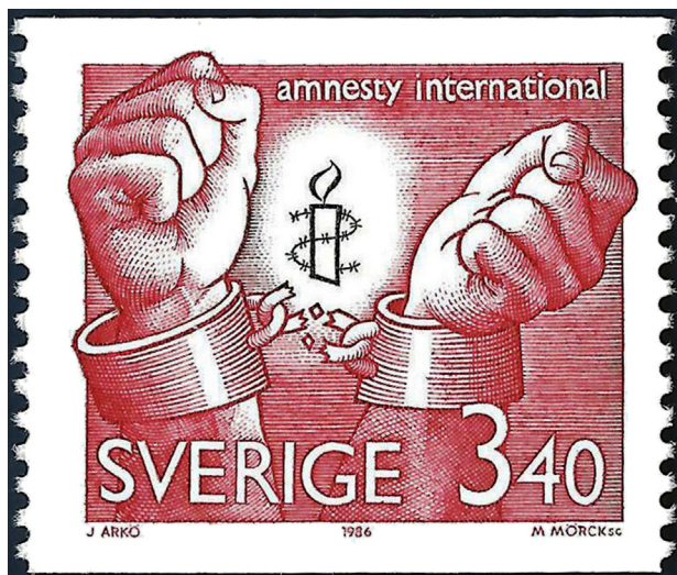
FIGURE 1: Amnesty International logo and torn hand cuffs. Country: Sweden. Occasion: 25th anniversary of Amnesty International. Day of issue: October 18, 1986. Value: 3.40 kron.

Amnesty International, founded in London in 1961, is a non-governmental organization focused on human rights around the world. The aim of the organization is “to conduct research and generate action to prevent and end grave abuses of human rights and to demand justice for those whose rights have been violated.” Its motto, inspired by a Chinese proverb, reads: “It is better to light a candle than to curse the darkness.” 1