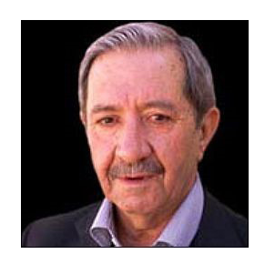
Figure 10. Prof. Hassan Tadjbakhsh.