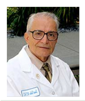
Figure 8. Prof. Samuel Rahbar.