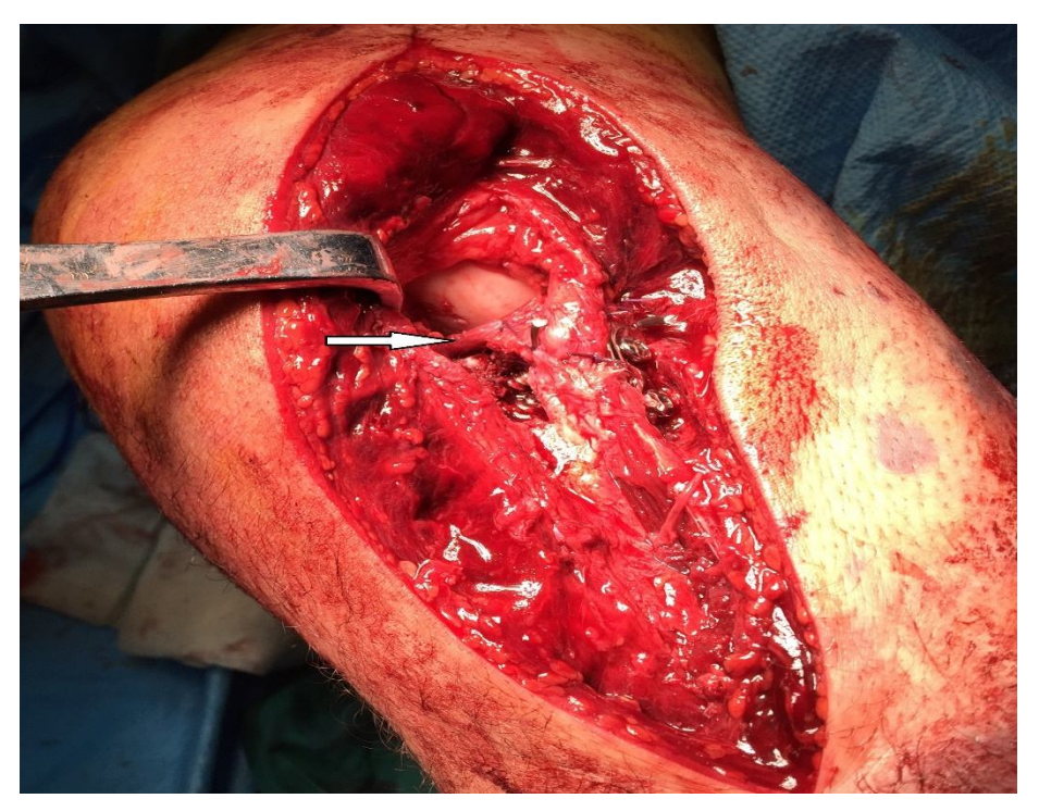
Fig 2B. Tibia bi-condylar plateau fracture and the knee dislocation associated with sever lateral meniscus rupture