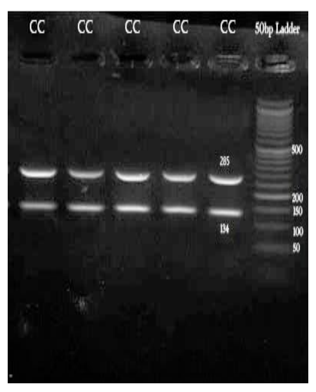
Figure (1). Agarose gel electrophoresis (1.5%) of PCR product of Tetra-Primer ARMS-PCR for rs11196205 in some individuals; CC homozygote is observed as two fragments (134 bp and 285 bp).

Table 5, there was no significant difference between control and case groups for haplotype distribution.