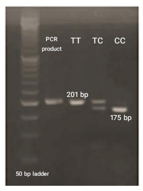
Figure (3). 3% agarose gel showing results for rs7903146 in some individuals; TT homozygote is observed as a fragment (201 bp) and CC homozygote is observed as two fragments (26 bp and 175 bp) and heterozygote (TC) is observed as three fragments (26 bp, 175 bp, 201 bp).