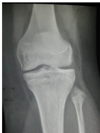
Figure 3. Corrected position of patella 5 months later

She underwent open patellofemoral ligament reconstruction using gracilis tendon graft. Intraoperatively, patient had small patella and hematoma over insertion of patellofemoral ligament on patella. Femoral side isometric point was achieved and the graft fixed to femur using a bioabsorbable screw. On the first follow-up two weeks after operation the slab was removed by patient and she had 100° knee flexion. Six week after operation she had full weight bearing and 130° flexion. One year later patient had normal patellar alignment and negative apprehension test (Figure 3).