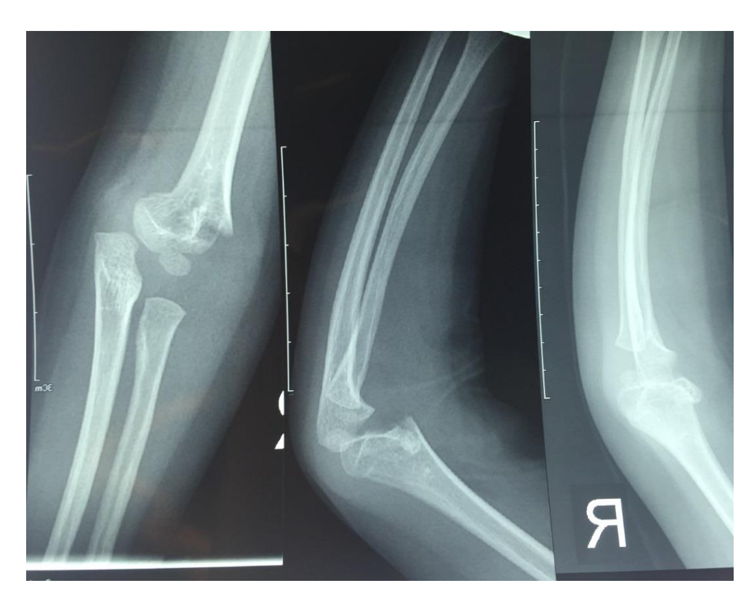
Fig 1. Fracture of suprachondylar(type 3 Gartlend)