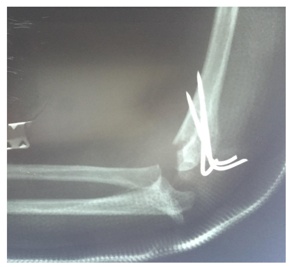
Fig 3. Radiography of post operation in follow up period after a week with loss of reduction due to internal rotation of medial