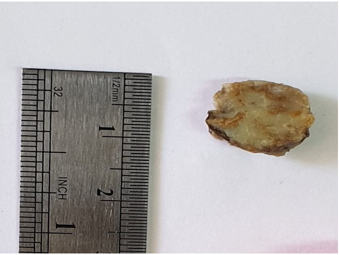
Fig 2. Gross photograph of the resection specimen shows a round well-defined gray-colored bony lesion