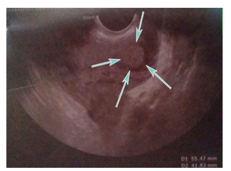
Fig 1. Ultrasound image of the abdomen shows heterogeneous area compatible with tubo-ovarian abscess (arrows)

On gross inspection a round gray-colored lesion, hard in consistency, measuring 2 cm in greatest dimension is seen (Fig. 2). On microscopic examination there was a well-developed bony trabecula in a background of fibroblastic proliferation (Fig. 3).