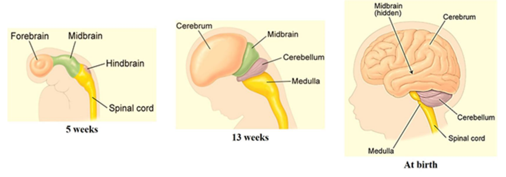
Fig 3. Growth and folding of the cerebral hemispheres during the fetal life

Based on biological studies, three different phases contribute to the differential growth: neuronal division and migration, neuronal connectivity, and synaptogenesis and synaptic pruning (50). Growth and folding of the cerebral hemispheres during the fetal life was shown in Figure 3.