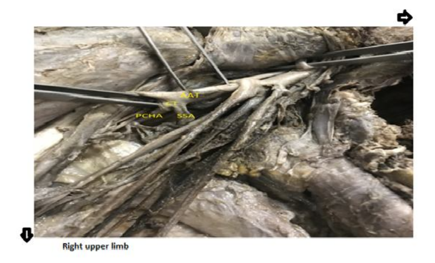
Fig 3. Showing the right axillary artery was giving a common trunk (CT) dividing into posterior circumflex humeral (PCHA) and subscapular (SSA) arteries.