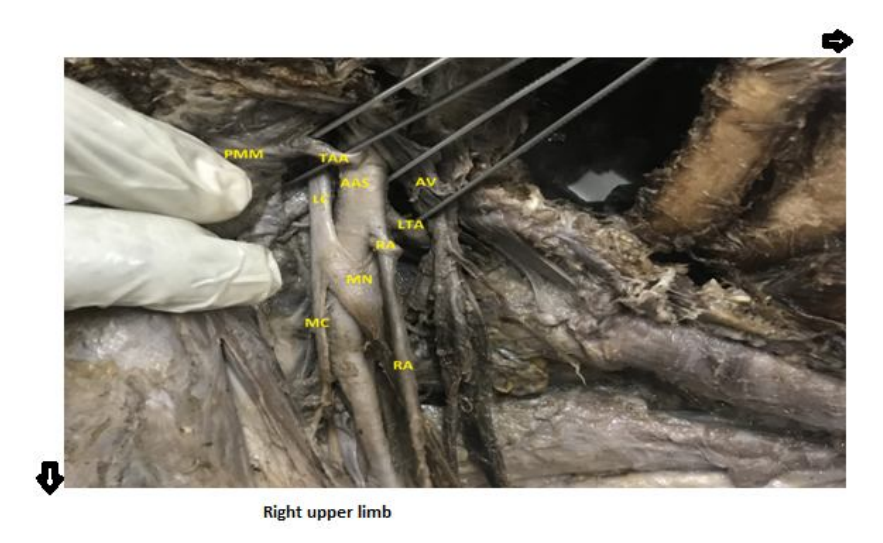
Fig 1. Demonstrating the; radial artery (RA), second part of axillary artery (AAS), lateral thoracic artery (LTA), thoracoacromial artery (TAA), axillary vein (AV), pectoralis minor muscle (PMM), lateral cord(LC), musculocutaneous nerve (MC), and median nerve formation (MN).

medial aspect of the arm, when it reaches the lower part of the arm which crosses superficial to the median nerve and biceps brachii muscle to the lateral side of the arm under the deep fascia, in its way to the roof of the cubital fossa distally. At this level, a communicating artery of about 1.40 cm connecting the radial limb was completely dissected. However, the brachial artery courses normally after that through the cubital fossa, and then continues as the ulnar artery. The radial artery runs superficially in the forearm, close to the medial side of the brachioradialis muscle on its way to the anatomical snuffbox and hand, with no pattern of variation.