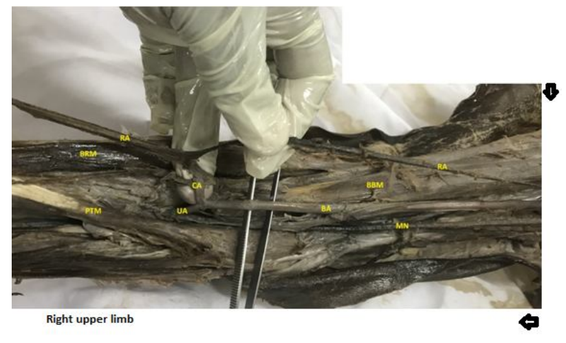
Fig 2. Demonstrating the; radial artery (RA), brachial artery (BA), ulnar artery (UA), communicating artery (CA), pronator teres muscle (PTM), biceps brachii muscle (BBM) and median nerve (MN).