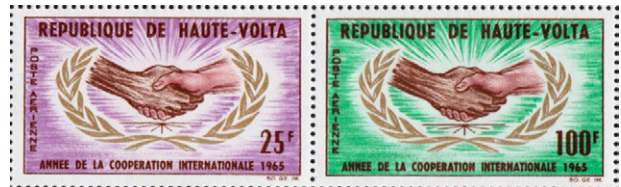
FIGURE 3: Burkina Faso (Upper Volta), Scott Catalogue # 23–24 and C24a sheet, issued: 1965, values: 25 and 100 F.

The proclamation, which coincided with the 20th anniversary of the United Nations, was commemorated internationally by members of the United Nations. Many countries around the world issued stamps with the common designs of hand shaking and the United Nations wreath. Figures 1 through 3 are 3 such stamps, which were issued by Iran, the United States of America, and Burkina Faso (Upper Volta), respectively.