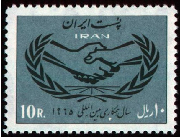
FIGURE 1: Iran, Scott Catalogue # 1325, day of issue: June 22, 1965, value: 10 rials.

On November 10, 1961, Indian Prime Minister Jawaharlal Nehru visited the United States of America. In response to his speech, the United Nations General Assembly proclaimed 1965 to be the International Cooperation Year. The goal was to increase awareness, understanding, and the importance of cooperation in the world community to facilitate the peaceful resolution of major international conflicts. 1