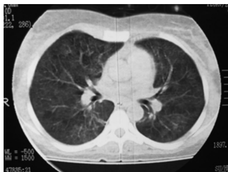
Figure 1. Diffuse ground glass opacity in both lungs on chest computed tomography scan four months before admission

One week after discontinuation of the aforementioned regimen, she became febrile again. A new consolidation in left lower lobe was the prominent finding (Figure 2). She rejected CT-guided biopsy; empirical amphotericin B and standard regimen of anti-tuberculosis (TB) were initiated. Finally, she was referred to our center for further evaluation. On admission, she was stable without remarkable findings in physical examination. Complete blood cell count, liver biochemistry and renal function test were all within normal range. During recent admission, valganciclovir and anti-TB were discontinued and bronchoscopy was performed. Serum and bronchoalveolar lavage (BAL) specimens were negative for galactomannan. Acid-fast bacilli were seen by direct Ziehl-Neelsen staining along with positive result of polymerase chain reaction (PCR) for Mycobacterium tuberculosis . Anti-TB regimen was initiated again, cyclosporine stopped and prednisolone dosage increased to 20 mg daily. Two weeks later the patient became febrile again associated with cough and malaise. The previous consolidation revealed further extension with central cavitation (Figure 3). A new work-up including bronchoscopy and open lung biopsy in the primary center solely confirmed the diagnosis of tuberculosis. She was referred again due to new-onset fever, non-purulent cough and mild exertional dyspnea without remarkable finding in physical examination.