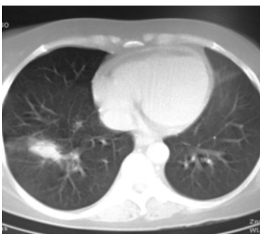
Figure 2. New consolidation in lower lobe