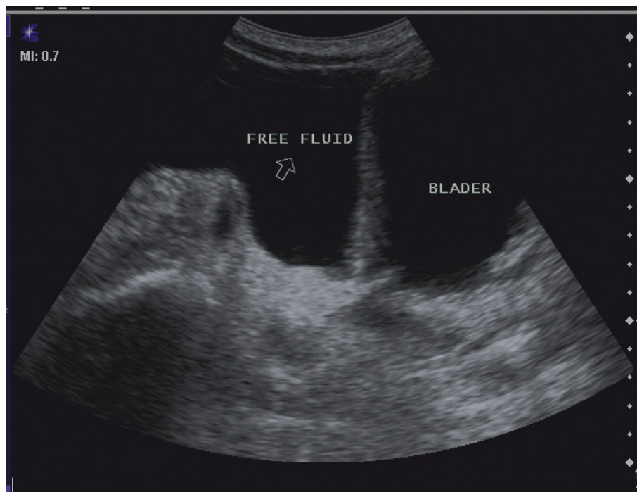
Figure 2 Ultrasonogram revealed free fluid in the paracolic gutter (right) and perisplenic (left).

Those with negative clinical signs and negative FAST are not followed by any other diagnostic methods. But in those patients with negative FAST and constant abdominal pain and stable hemodynamic due to shortage of intravenous contrast material in our center they have to undergo repeated FAST after 12 to 24 hours.