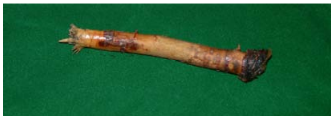
Fig. 2. Photograph showing the piece of wood.

especially important because it may serve as an unrecognized nidus for infection. Wood is an excellent medium for micro organisms due to the porous consistency and organic nature it has. The retained wooden foreign body may result in abscess and fistula formation. 6 The evaluation for tuberculosis and Wegener's granulomatosis was negative in this patient. The patient was unaware of the foreign body in her lung until the surgical resection of the pathology 8 years after the trauma. The injury most likely occurred while the patient accelerated down a slope lying supine on the ground and the apex of a wooden fragment implanted her chest. In the patient with recurrent unifocal pneumonia we should consider an underlying problem such as foreign body.