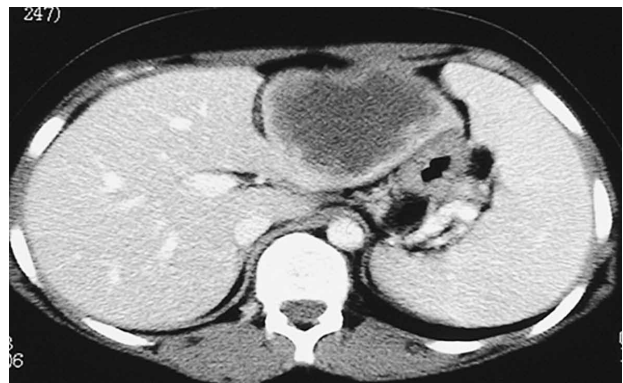
Figure 1. Axial computed tomography showed a well-defined hypodense mass in the left lobe of the liver.

The patient underwent partial left liver lobe