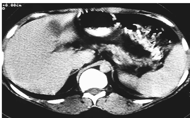
Figure 4. Axial computed tomography 1 year after the end of chemotherapy (control).

cyclophosphamide, 1000 mg, hydroxy adriamycin, 80 mg, and oncovin, 2 mg, plus prednisolone, 100 mg/d, for 5 days (R-CHOP protocol). During and after chemotherapy, there were not any rises in serum creatinine level. Immunosuppressive therapy with sirolimus, 2 mg/d, and mycophenolate mofetil, 1.5 g/d, was started 2 months after all courses of chemotherapy were completed. Sixteen months after the last course of chemotherapy, she was in a good condition without any recurrences of lymphoma in the liver or any other organs (Figure 4), and her serum creatinine was 1.2 mg/dL.