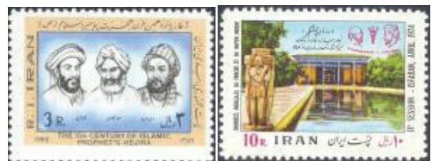
Figure 34. Left) Issued by Iran in 1980, depicting al-Farabi, al-Biruni, and Avicenna together; right) Avicenna, issued by Iran in 1974