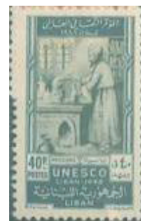
Figure 1. Avicenna brewing herbs, issued by Lebanon in 1948

The first stamp was issued by Lebanon for the anniversary of the medical faculty inauguration in 1948 (Figure 1) and depicts Avicenna brewing herbs. In 1951, Afghanistan issued two stamps to commemorate the anniversary of the medical faculty (Figures 2 and 3). In 1966, the Yemen Arab Republic issued two stamps for the inauguration of a new WHO headquarter’s building in Geneva (Figures 4 and 5). Kuwait, in 1969 on the occasion of World Health Day, printed the vignette of Avicenna on two stamps (Figures 6 and 7).