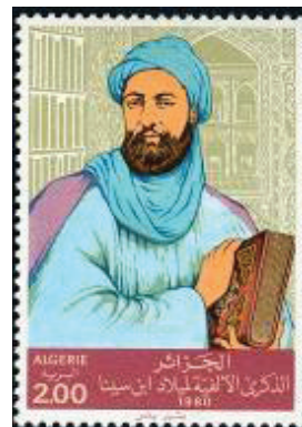
Figure 8. Avicenna, issued by Algeria in 1980