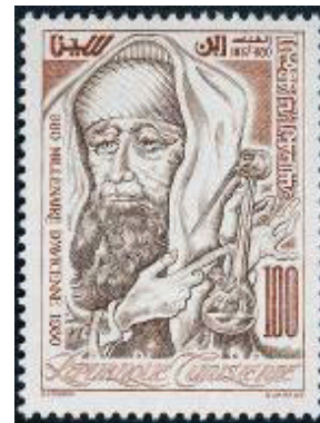
Figure 17. Avicenna, issued by Tunisia in 1980