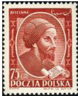
Figure 28. Avicenna, issued by Poland 1952

mausoleum. Each series depicted a period of Iran's history. The first was during the Achaemenids, the second was during the Sassanians, the third on the Islamic period, the fourth was about historical places and the fifth was Avicenna, himself. 2