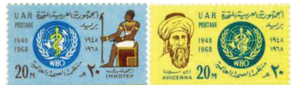
Figure 20. Avicenna, issued by Egypt in 1968 and paired with a stamp depicting Imhotep

Other countries, including: the Comoros Islands (Figure 23), France (Figure 24), Jordan (Figure 25), Hungary (Figure 26), Pakistan (Figure 27), Poland