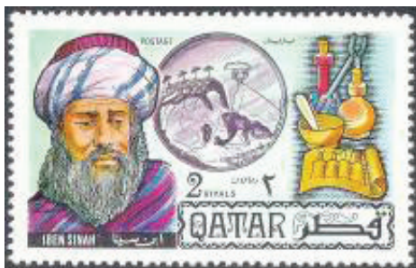
Figure 29. Avicenna, issued by Qatar in 1971