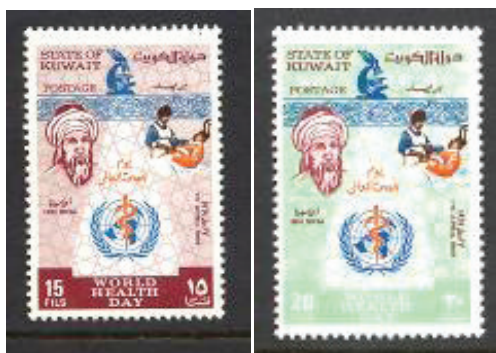
Figures 6 and 7. Avicenna, issued by Kuwait in 1969