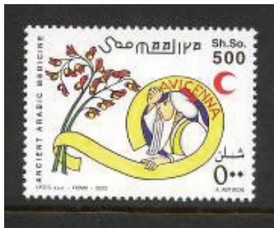
Figure 30. Avicenna, issued by Somalia in 2003