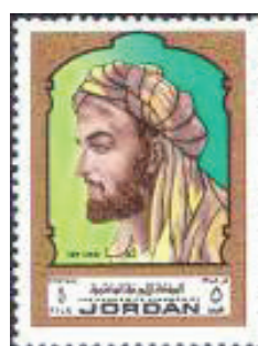
Figure 25. Avicenna, issued by Jordan in 1971