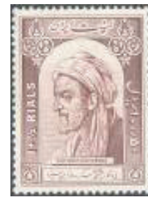
Figure 32. Avicenna, issued by Iran in 1954