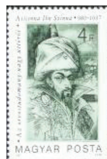
Figure 26. Avicenna, issued by Hungary in 1987