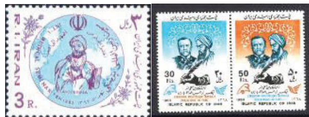
Figure 35. Left) Avicenna, issued by Iran in 1983; right) Avicenna alongside Pasteur, issued by Iran in 1989