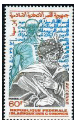
Figure 23. Avicenna, issued by the Comoros Islands