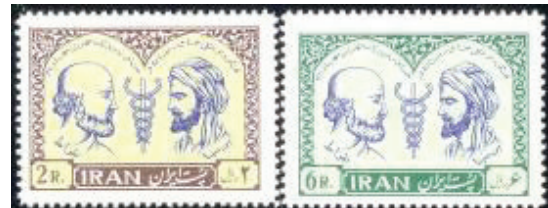
Figure 33. Avicenna and Hippocrates, issued by Iran in 1962