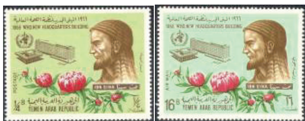
Figures 4 and 5. Avicenna, issued by the Yemen Arab Republic in 1966