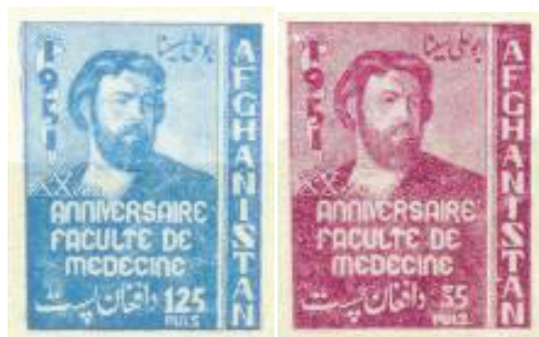
Figures 2 and 3. Avicenna, issued by Afghanistan in 1951