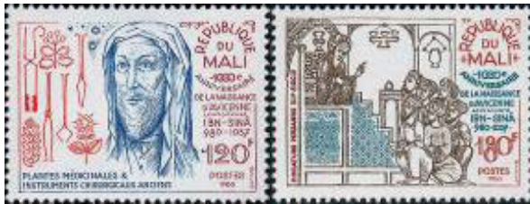
Figures 12 and 13. Avicenna, issued by Mali in 1980 on the 1000 th anniversary of his birth

set of four stamps that depicted the vignettes of Avicenna, Leonardo da Vinci, Victor Hugo and Nicolai Gogol (Figure 21). Dubai issued a set of four stamps which depicted Avicenna, Durer, Newton and Voltaire (Figure 22). It is interesting to note that in some of the stamps Avicenna is depicted in native clothing, with the attempt to make him look like the indigenous people of that country.