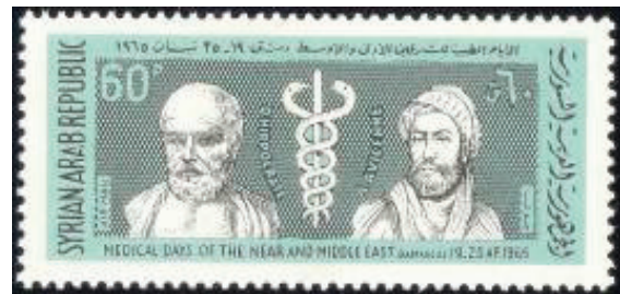
Figure 18. Avicenna and Hippocrates, issued by Syria in 1965