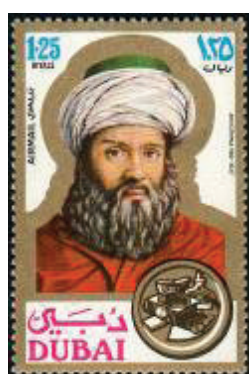
Figure 22. Avicenna, issued by Dubai