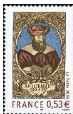
Figure 24. Avicenna, issued by France in 2005

The first Iranian stamp with a picture of Avicenna was issued in 1954 (Figure 32).