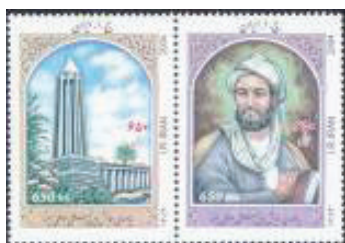
Figure 36. Avicenna and his mausoleum, issued by Iran in 2004

The occasion of Physician's Day in 2004 was commemorated by a stamp depicting the picture of Avicenna and his mausoleum (Figure 36).