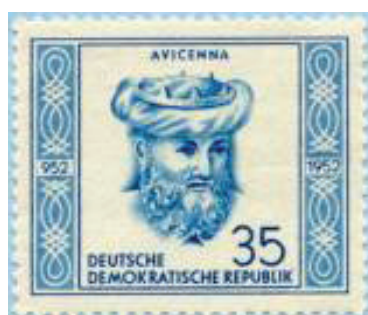
Figure 21. Avicenna, issued by the German Democratic Republic in 1952

(Figure 28), Qatar (Figure 29), Somalia (Figure 30), and Tajikistan (Figure 31) have also issued stamps in memory of Avicenna.