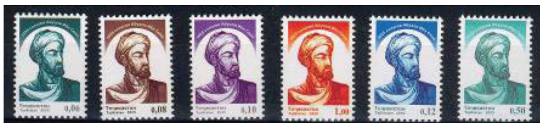
Figure 31. Avicenna, issued by Tajikistan in 2005