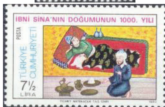
Figures 15 and 16. Avicenna, issued by Turkey in 1980