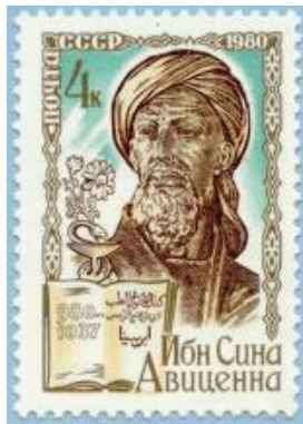
Figure 14. Avicenna, issued by the Soviet Union in 1980