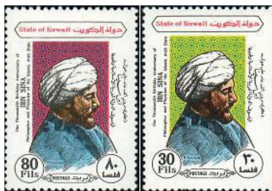
Figures 9 and 10. Avicenna, issued by Kuwait in 1980