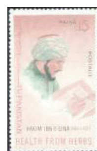
Figure 27. Avicenna, issued by Pakistan in 1966

Between 1950 and 1954 Iran issued five series of stamps for the millennium ceremonies of Avicenna. The aim was to raise additional funds to rebuild his