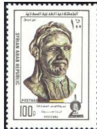
Figure 19. Avicenna, issued by Syria in 1981