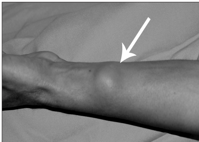
Figure 1. The swollen area due to aneurysm of the left radial artery (arrow)