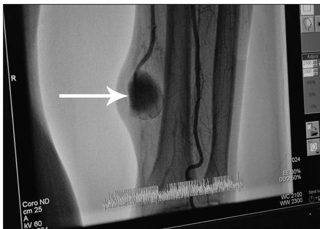
Figure 3. The aneurysm at the site of operation (arrow)