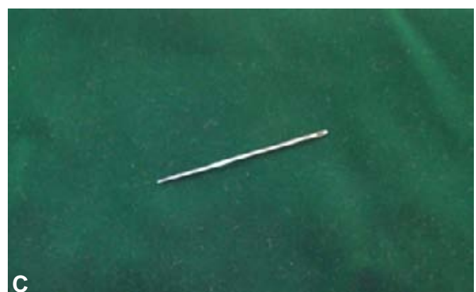
Fig. 1. An 18-year-old man with an ingested foreign body.

A. Plain abdominal x-ray shows a needle-like object (arrow) in the RUQ.