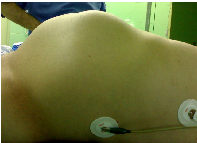
Figure 1 Image show severe abdominal distention of a 45 year's old man.

Surgical excision of the mass was performed completely. Grossly left kidney was completely replaced by lobulated