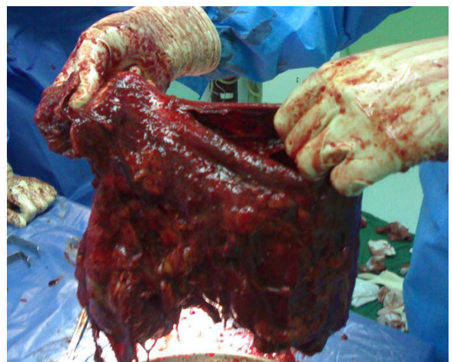
Figure 3 Photograph show gross appearance of a complex multiloculated cystic mass replacing the entire left kidney.

The renal capsule, Ureter and renal hilar vessels were intact (T3).