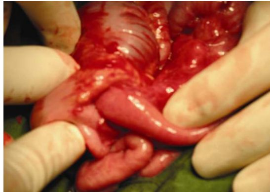
Fig 3- Invagination of transverse colon into descending colon

Intussusception is the most common cause of acute intestinal obstruction in infants and young children [8] . Eighty percent of patients are younger than 24 months [1] and 95% of cases are ileocolic in location, with an equal percentage in which no pathologic lead point is evident on barium enema or laparotomy [9] . Other types of intussusception that are rarer and have an anatomic lead point occur in children older than 2 years of age [4] . Possible lead points include Meckel diverticulum [1] ,