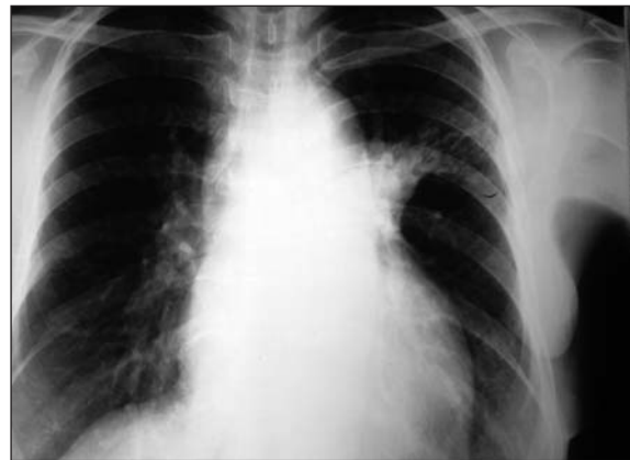
Figure 1. Plain chest X-ray shows left hilar mass like lesion with left upper lobe infiltrate mimicking tuberculosis.

A 70-years old nonsmoker woman was presented to our clinic with hemoptysis, anorexia, and weight loss for two months. She had history of diabetes mellitus for two years without history of loss of consciousness, convulsion in past, and alcohol or drug abuse. There was no history of recurrent infection or other evidence of immunodeficiency. On physical examination, heart rate was 60 beats/min, blood pressure 130/60 mmHg and temperature 36.5°C, and the dental hygiene were bad. Lung auscultation revealed diminished breath sounds with crackles and wheezing at the left upper lobe. Sputum was reported negative for acid fast bacilli three times. Chest X-ray and computerized tomography scan of the patient showed a mass at left hilum with infiltration in left upper lobe (Figure 1,2). A bronchoscopy was planned with a presumptive diagnosis of bronchogenic carcinoma or tuberculosis. It showed several vegetations in