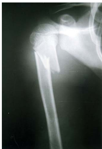
Figure 2. Fracture of the right humerus.

Reviewing the cases in the literature, it seems that the divergent dislocation of the elbow has different types according to the lodged position of radial head at the initial presentation, i.e.: 1) posterior divergence, 2) transverse (mediolateral)