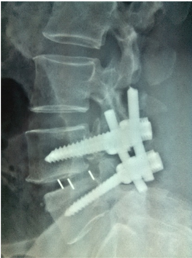
Fig. 2. A postoperative X-ray illustrating the pedicle screw construct and interbody cage used to correct the deformity.