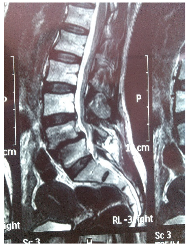
Fig. 3. Lumbosacral MRI Showing L4/L5 spondylolisthesis.