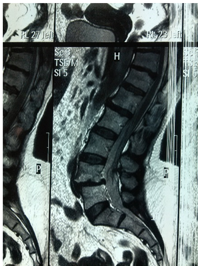
Fig. 1. Lumbosacral MRI Showing L4/L5 spondylolisthesis.

All surgical operations were performed by the same surgeon using the same surgical technique. surgeries were done in prone position under controlled hypotensive general anaesthesia. At the beginning, pedicle screws were inserted for the patients by a mid-line approach. When indicated, hemilaminectomy or laminectomy was done and nerve root was followed out past its nerve root canal to ensure adequate decompression and remove any other bony or soft tissue impingement. In the TLIF group, the facet joint of the intended levels was identified and the inferior and superior facets