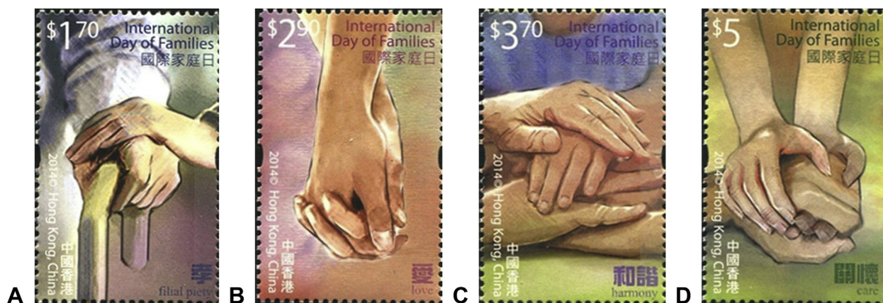
FIGURE 1: International Day of Families. Day of issue: May 15, 2014. Size: 28 × 45 mm. A A youngster puts one hand on the back of the hand of an elder walking with a cane. The Chinese character at the bottom means “filial piety”. Value: $1.7. B Hand in hand. The Chinese character at the bottom means “love”. Value: $2.9. C Family members with their hands stacked together. The Chinese phrase at the bottom means “harmony”. Value: $3.7. D A youngster is holding an elder’s hand with both hands. The Chinese phrase at the bottom means “care”. Value: $5.