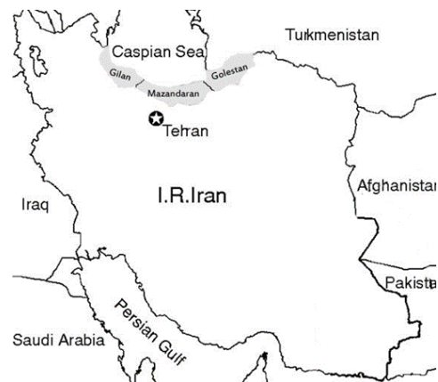
Figure1: Geographic situation of Gilan, Mazandaran and Golestan, Iran

(figure1). Data were collected retrospectively by reviewing all medical records of cancer patients registered in Cancer Registry Center of health deputy for Gilan, Mazandaran and Golestan provinces during a 6-year period (2004-2009) (23). The date of diagnosis was confirmed coded and was based on the International Classification of Diseases for Oncology (ICD-O).