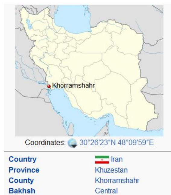
Fig.1: Location of Khorramshahr city, Iran

Given the importance of what has been mentioned so far about calcium intake among adolescent girls and since no comprehensive study was conducted in Khorramshahr city ( Figure.1 ), the aim of the present study was to investigate the nutritional behavior of female high school students of Khorramshahr regarding the consumption of calcium-rich foods.