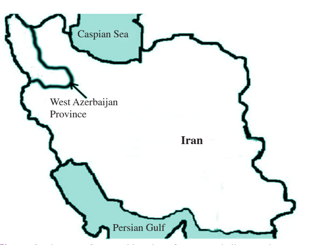
Figure 1. The map of Iran and location of West Azarbaijan Province.

Larvae collection was carried out from different habitats using the standard (350 mL dipper) dipping method in 7 localities of three counties across West Azerbaijan Province (Figure 1)<sup>[19]</sup>.