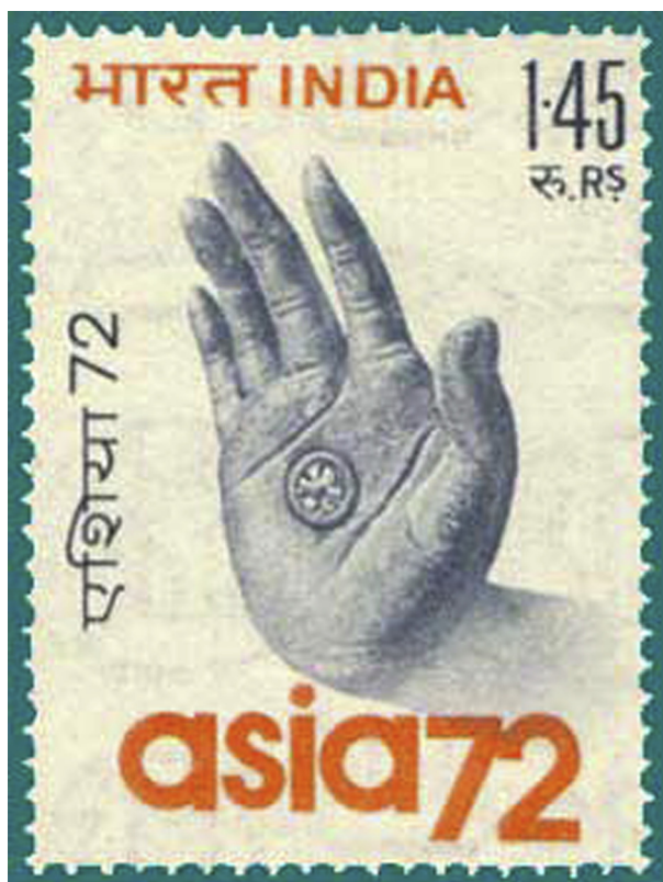
FIGURE 1: Hand of Buddha in “Abhaya Mudra.” Country: India; day of issue: November 3, 1972. Value: 1.45 Indian Rupees.