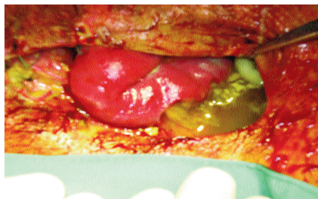
Figure-1: Multiple ischaemic necrosis and perforations in small bowel.

His right lower extremity was amputated from below the knee 5 years earlier and hand fingers 3 years before the admission for acute abdominal pain. Previous angiographic and histopathological examinations of amputated extremities revealed Buerger's disease. He didn't stop smoking after sympathectomies and had not