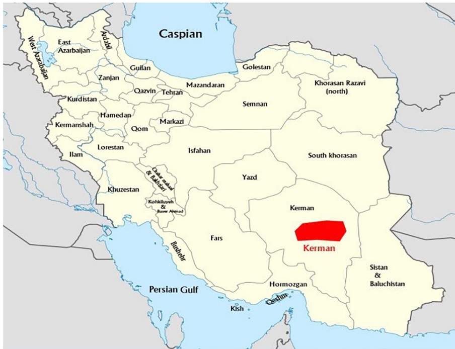
Fig. 1. The geographical location of Kerman, Iran.

or any kind of human climatic activity, because it takes into consideration various complex horizons. The Rayman model was originally developed by Matzarakis and the main purpose of RayMan software is to compute radiation flux densities, sunshine duration, shadow spaces, and thermo-physiologically related assessment indices using only a limited number of meteorological and other input data. A comparison between measured and calculated values for mean radiant temperature indicates that the simulated data closely resemble measured data (Matzarakis et al., 2007, 2010).