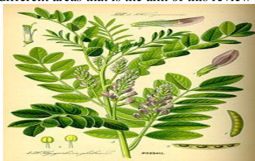
Figure 1: Glycyrrhiza glabra

Licorice with the scientific name of Glycyrrhiza glabra L. (Figure 1) is one of these plants. It is a perennial herb of fabaceae family which possesses a wide range of medicinal and food compounds in its root and rhizome. Licorice is widely used in medicinal, food and also tobacco industries. However, it grows easily so that it decreases products in farms and gardens due to high development of root and rhizome (Chandler, 2000). With regard to increasing value and special position of this plant in new medicinal industries, it is necessary to recognize its various potentials in different areas that is the aim of this review paper.