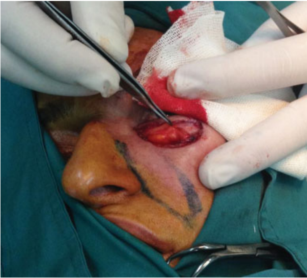
Fig. 2 Removal of basal cell carcinoma (BCC) by a cancer surgeon.

pedicle and extending it to the nasojugal area using a novel modified method, making a partial-thickness nasolabial dermal tail in the terminal portion of the flap.