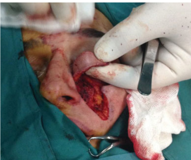
Fig. 3 Modified nasojugal flap after designing and harvesting.

The donor site was repaired in an anatomic manner by bilateral advancement of the surrounding tissue and interposing the flap into the defect. Our next step was to prevent ectropion by making a tunnel under the orbicularis oculi muscle. The distal dermal tail of the flap was brought to the lateral canthus through the tunnel (►Fig. 4), and the lateral canthus was sutured to the dermal tail of the flap, which was fixed in its new position (►Figs. 5 and 6).