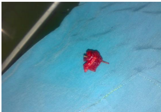
Fig.3: Extracting the Rivet and Sutured with Prolene 4-0

nerve. The penetration site of the rivet to the right ventricle was exposed, and a purse was sutured around the site using PROLENE 4-0, which we tightened while extracting the rivet (Figure.3).