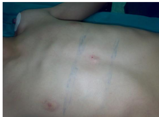
Fig.1: A small, erythematous wound on the distal third of the sternum.

100/min, respectively. A small, erythematous wound about 0.5×0.5 cm was seen on the distal third of the sternum (Figure.1).