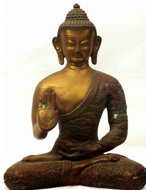
FIGURE 2: Statue of Lord Buddha depicting “Abhaya Mudra.”

In 1972, India organized the Third Asian International trade fair in New Delhi. To commemorate the event, the government of India issued a postal stamp on November 3, 1972, depicting the hand of Buddha in “Abhaya Mudra” (Fig. 1). 1