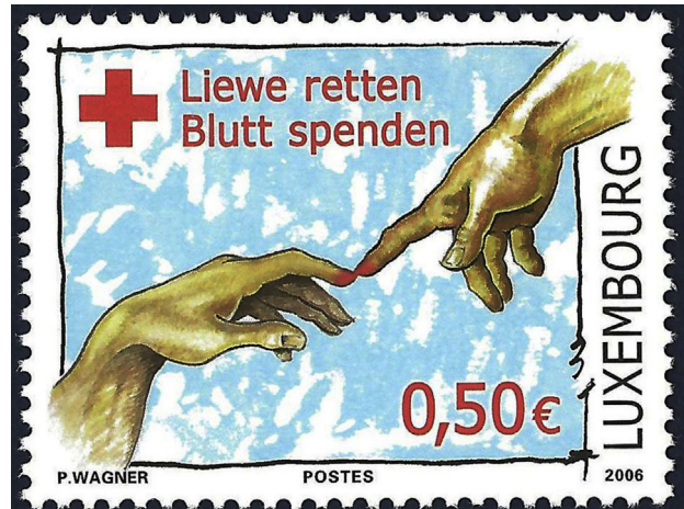
FIGURE 2: The hands from Michelangelo's Creation of Adam , saving life and blood donation. Country: Luxembourg. Occasion: Blood donation. Day of issue: March 14, 2006. Value: 50 cents.

Hands from Michelangelo's famous fresco Creation of Adam , located on the ceiling of the Sistine Chapel in Rome, has been an inspiration for many works of art including several stamps. 1,2