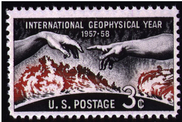
FIGURE 1: The hands from Michelangelo's Creation of Adam and solar disk. Country: United States. Occasion: International Geophysical Year. Day of issue: May 31, 1958. Value: 3 cents.