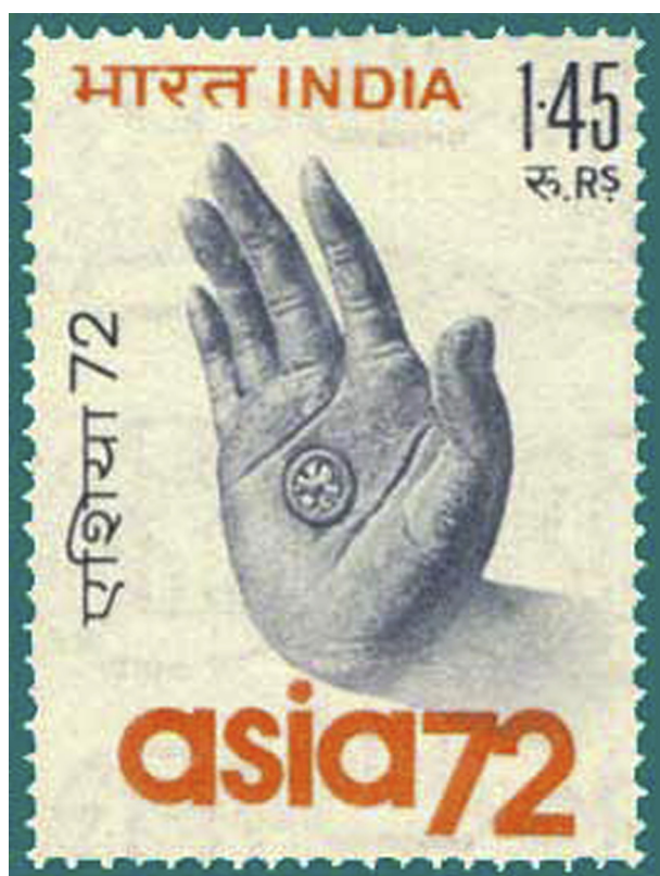
FIGURE 1: Hand of Buddha in “Abhaya Mudra.” Country: India; day of issue: November 3, 1972. Value: 1.45 Indian Rupees.