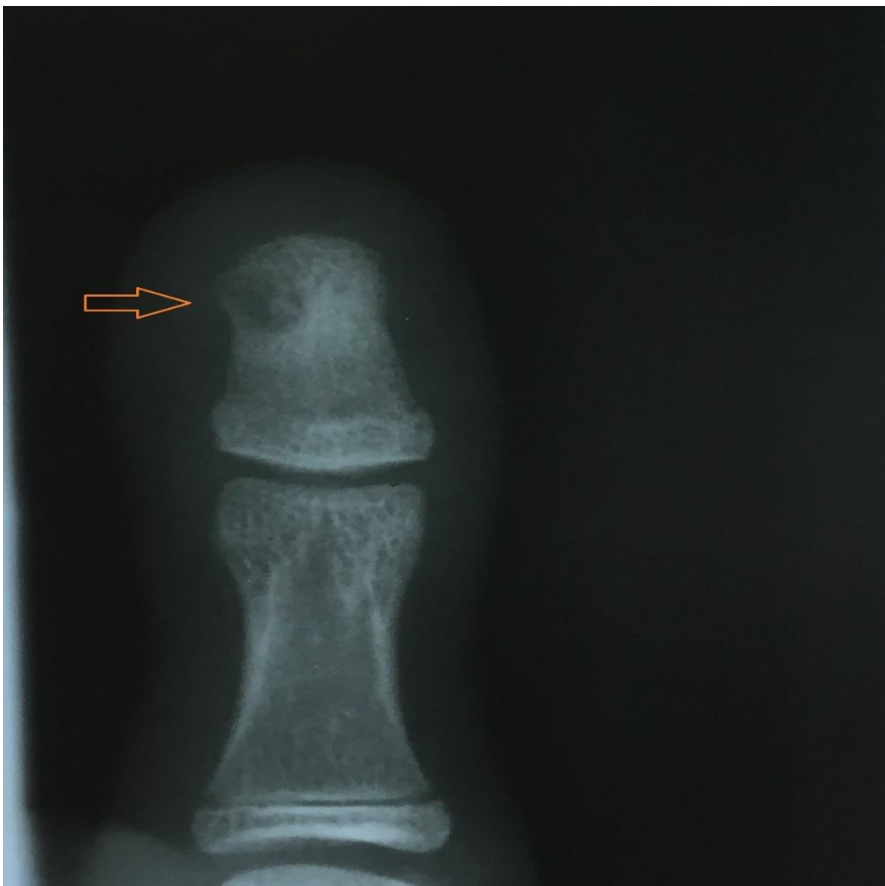
Fig 2. Anterior posterior view radiography of thumb indicating lucent lesion with sclerotic margins.