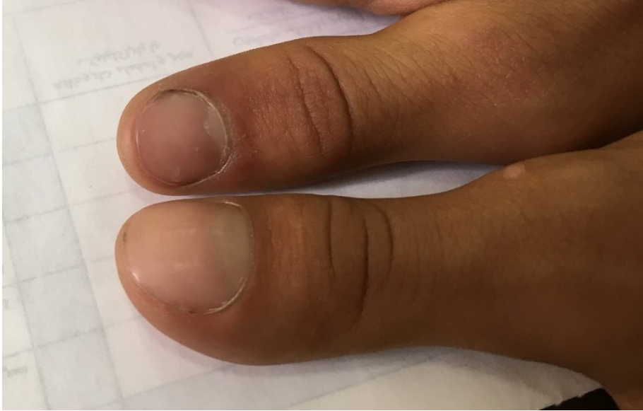
Fig 1. Clinical photo of the involved thumb, as it can be seen, it is swelling in comparison with opposite thumb and clubbing can be observed.